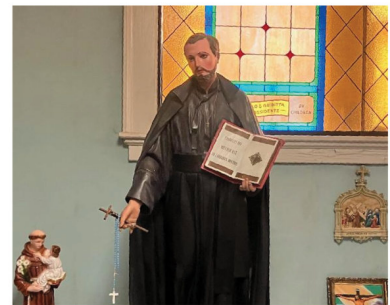
Pictured is a statue of St. Philip Neri in the shrine at St. Anthony Church in New Haven. The saint was an Italian Catholic priest who founded the Congregation of the Oratory, a group of secular clergy dedicated to pastoral care and charitable work.

Situated in the basement of St. Anthony Church, 70 Washington Ave., New Haven, the shrine welcomes visitors for parish meetings, gatherings and youth activities. You can also visit the shrine on Sundays after the 8 a.m. and 1 p.m. Masses.