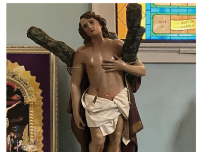
A statue of St. Sebastian is one of several statues on display in the shrine at St. Anthony Church.