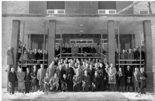
Priests and Catholic retreatants gather for the very first retreat Feb. 2 to 4, 1951, at the Holy Family Passionist Retreat Center in West Hartford.

For updates on these and other anniversary events, visit holyfamilyretreat.org/calendar-of-events .