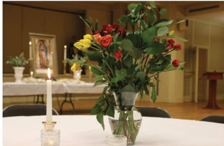
Roses, candles and religious images set a quiet and prayerful tone for a SEEN gathering.

“The name ‘SEEN’ is important because very often, nobody knows what happened. The parents hold it inside,” she explains. “But we’re here to affirm the dignity of the life lost. As Catholics, we believe that life begins at conception, and every soul has meaning and purpose.”